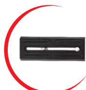
Sliding Plate SP-MARK