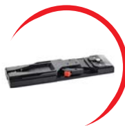
Tripod Adapter TA-2