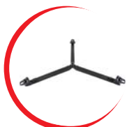
Ground Spreader GS-MARK