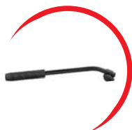
Pan Bar PB-MARK